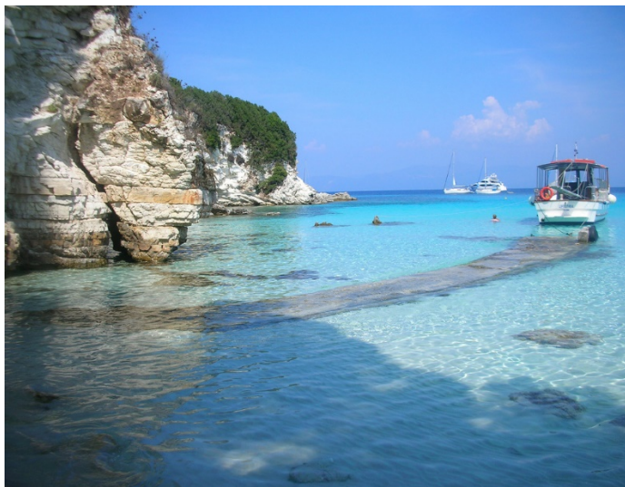
THE BLUE CAVES IN SUNSET!!

Voutoumi is a nice, pebbled beach located on the north eastern side of Antipaxos Island. It is situated inside a large cove with high rocks covering both sides of the beach. The water here is shallow, ideal for all ages, while snorkeling near the rocks is a nice activity. There is a tavern on the hill behind the beach which serves traditional snacks. There are no shops on the island but you can taste the popular local wine at the taverns. There are no other facilities in this secluded area.